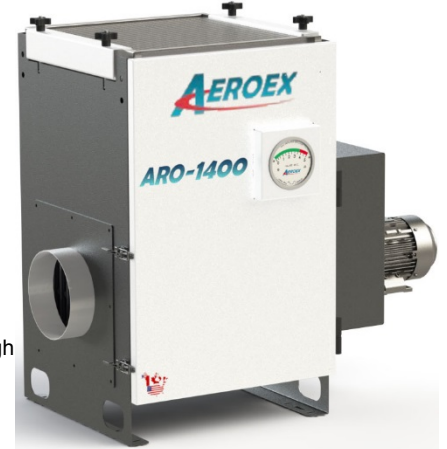
Shown, left hand suction